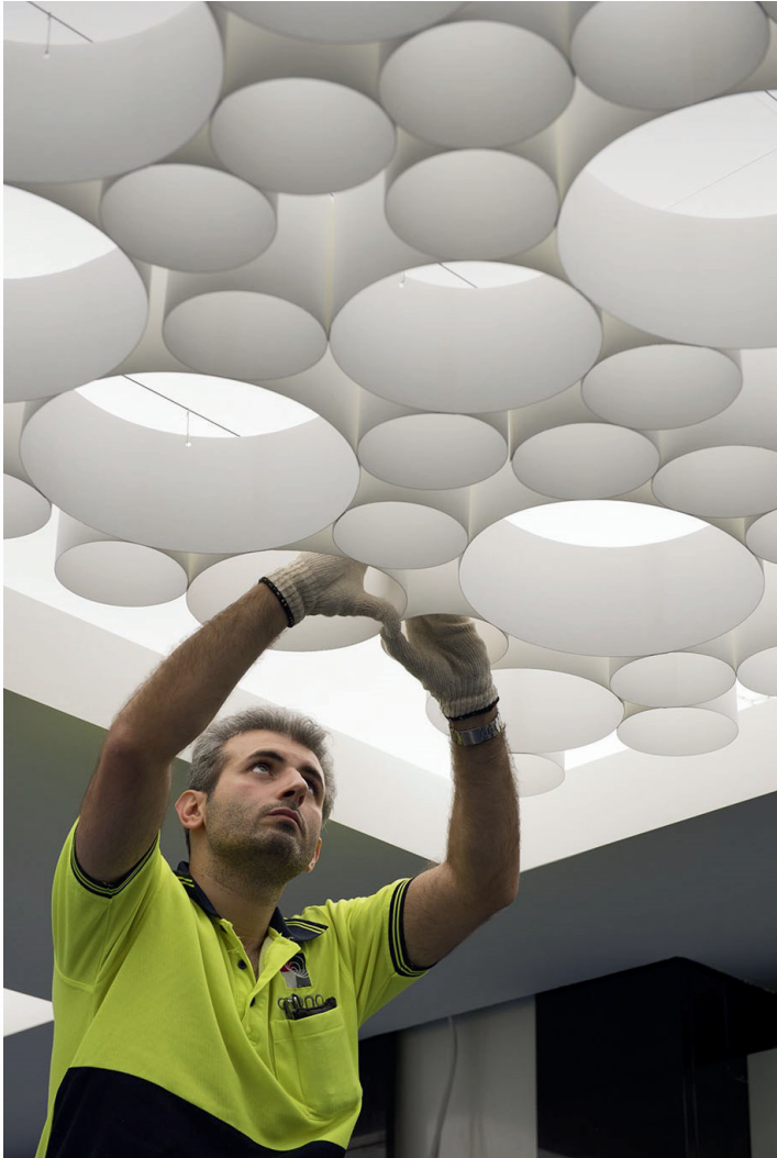
Installation of AO-Gami tubes in ASB Queen Street Branch