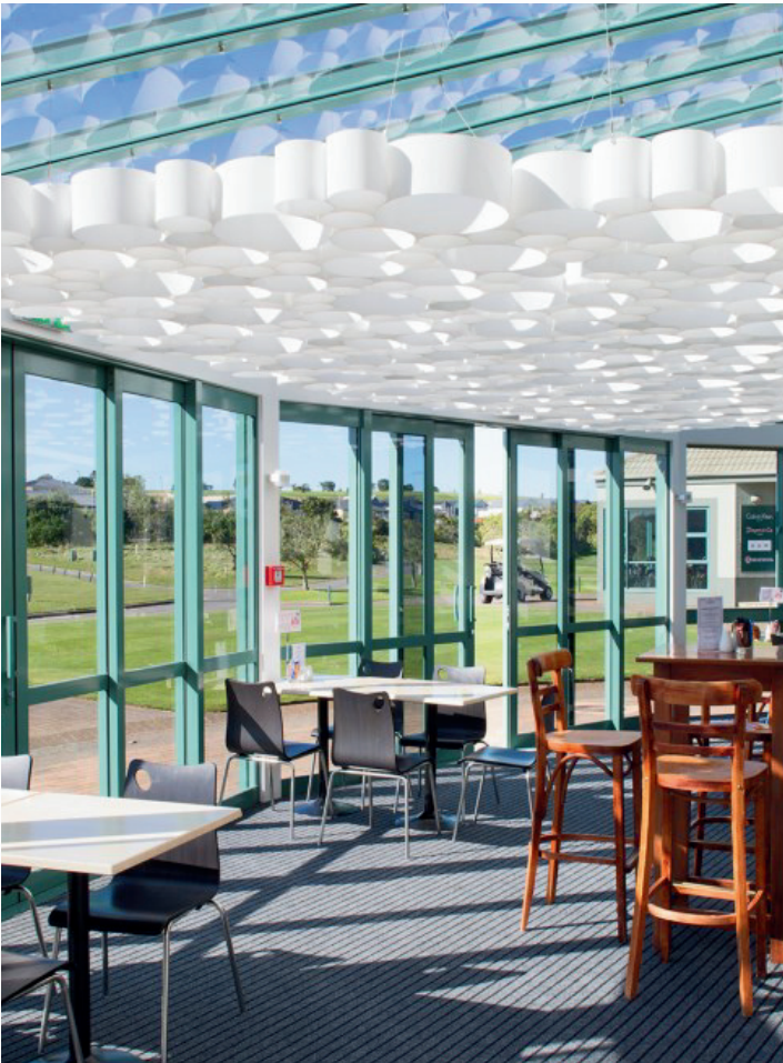
Gulf Harbour Country Club, conservatory