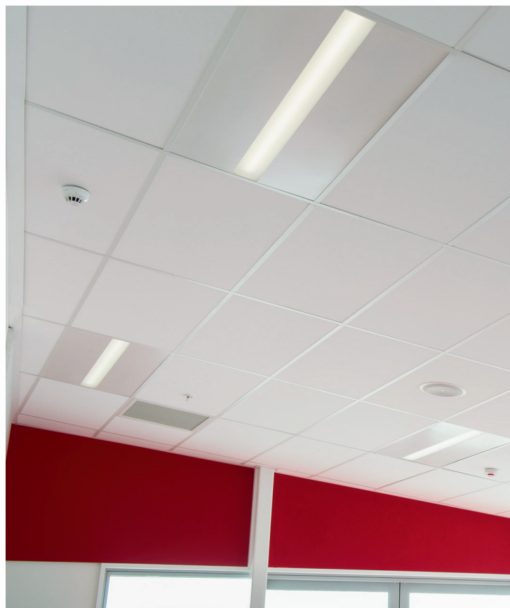
Photo: Haeata community college classroom.