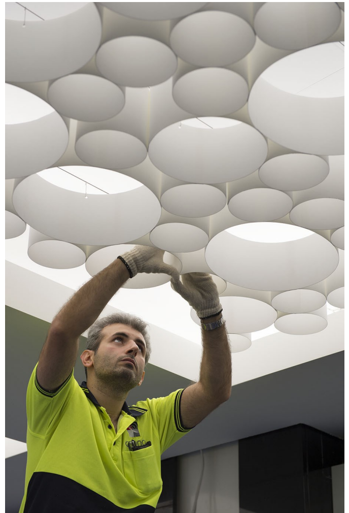
Installation of AO-Gami tubes in ASB Queen Street Branch

Supply and install AO-Gami™ acoustic feature ceiling as manufactured and supplied by Asona Ltd Tel: 09 525 6575 info@asona.co.nz, Suspend ceiling from manufacturers proprietary suspension system comprising tension catenary wires at 300-400 mm centres, fixed to load bearing structure. Clip modules 1 & 2 to catenary wire with AO-gami hook hanger and infill with AOG-15 tubes to complete the ceiling. Refer to manufacturers shop drawings. Contractor shall flat pack packaging and return to Asona for reuse (NZ only) (Asona ceiling Masterspec specification available).