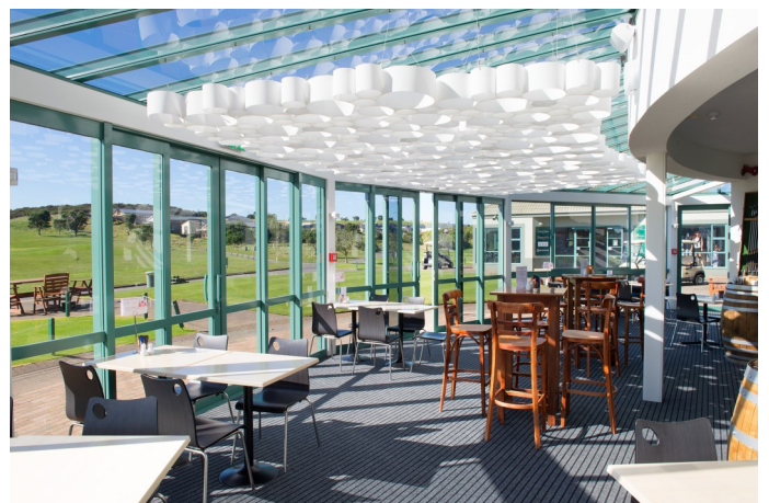
Gulf Harbour Country Club, conservatory